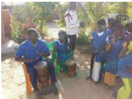
Teachers playing the tom-tom

The Covid 19 pandemic has also affected our country. Together we have been through a time of trial which is still going on. We have experienced some difficult moments. Teaching was interrupted for 7 months last year. The teachers gave sets of exercises every week, for a few months, to help the students keep up with their work. In the villages there is no possibility of following courses over the internet ... many do not yet have electricity. You can imagine that the return to school was very tough. Most of the children had forgotten everything, or almost.