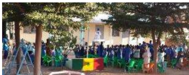
Celebration of the Feast of St Angela, 26 January 2021

Dear friends, we thank you very much for all you do for our schools! Many children benefit from it. Otherwise, we could not continue to welcome them. Your help and donations are divided into these various headings: schooling, canteen, school supplies and transport. The families are very grateful to you! We are sending you their gratitude.