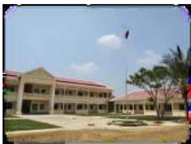
Flag Pole donated by the builders.