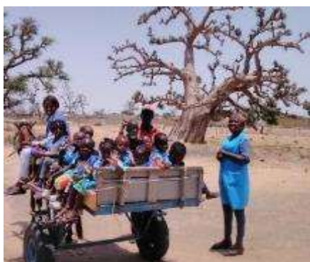
Ndiouck cart 04 2021

The cart transporting the children from surrounding villages continues and enables many children to attend our school. We help pay for part of this transport. Without this help, parents would not be able to be sure to get their children to school..