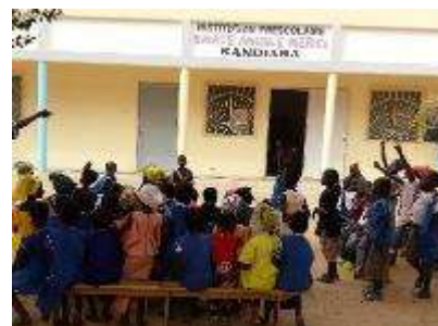
Mardi gras 2021

according to the school calendar: mid-August for teachers and in July 2021 for our pupils.