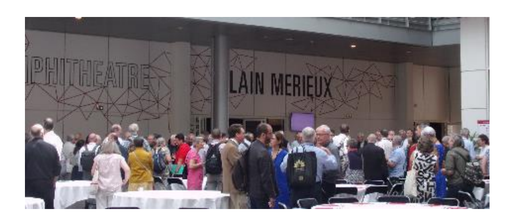
The Catholic University of Lyon was the place of our many exchanges.

During our multiple exchanges, the grace of humility, of trust in others, of a love for the Church greater than my own interest, opened a path of conversion for me to be more confident in the Holy Spirit and to serve better the women and men to whom I am sent.