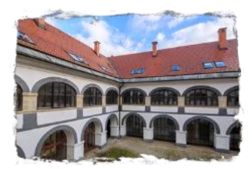
Convent of Mekjnje, now a museum.

Visiting places where so many elderly sisters gave their lives to God by announcing his word, allowed me sense how much could be required in a spirit of faith to enter into a new life.