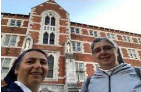
Centre Nano Nagle at Cork

I participated in the European exchange this year from mid-August to mid-October. Sisters from Ireland accepted me in their province - I am very grateful to them for their acceptance. The main reason for my experience is to improve my English language. The sisters accepted me in the city of Cork, which is also deeply connected with the history of the arrival of the Ursuline sisters in Ireland at the invitation of venerable Nano Nagle. Together with the sisters, we celebrated the 250th anniversary of the sisters' arrival in Ireland.