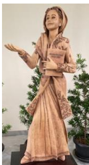
New statue of St Angela at Jalan Pos, Jakarta.