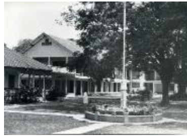
7. AGUUR, Rn. THA.06/1.1, Regina Coeli, Chiangmai, View of a part of the building, 1950