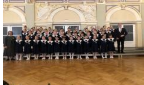
The choir : « The stars of St. Ursula »