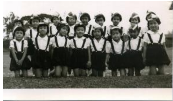
10. AGUUR, Collection Souvenirs of the missions, Regina Mundi, Bangkok 1957

The sisters still carry out their apostolate today through the institutes: