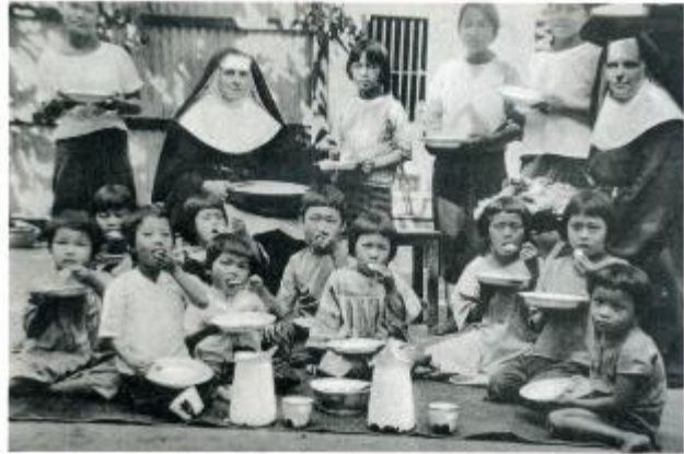
3. AGUUR, Rn.THA.03/2.10, Orphanage Calvary Church , 1925

At the request of Bishop Rene Perros , the Ursulines opened another school in Bangkok in 1928 for the Siamese in the upper classes: ' Mater Dei Institute ' (figg. 4-5).