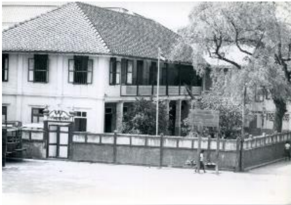
2. AGUUR, Rn.THA.03/1.1, Rosary School or Calvary School , [1954]