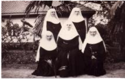
6. Foundresses of the second Ursuline school and community, Regina Coeli, Chiangmai, 7 th April 1932

belonged to the missionary apostolate were inaugurated in this area of the mission. Therefore, in addition to schools for the upper and middle classes, they organised free courses in schools for children from the poorer classes.