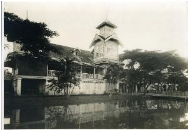
4. AGUUR, Rn.THA.04/1.1, Mater Dei, Bangkok , 1928

At the request of Bishop Rene Perros , the Ursulines opened another school in Bangkok in 1928 for the Siamese in the upper classes: ' Mater Dei Institute ' (figg. 4-5).