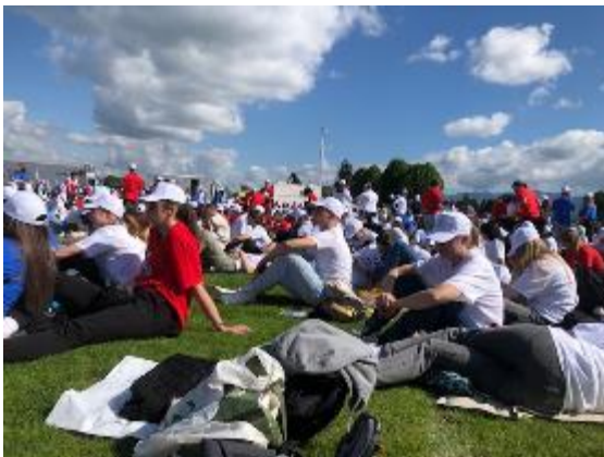
National Youth Meeting in Gospić