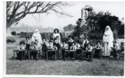
8. AGUUR, Collection Souvenirs of the missions, Chiang Mai class, [1935-36]

In 1955 a request was made for a third mission house to be opened in Bangkok. The response to the supplication is positive and authorisation was granted on 9 May 1955 . 3 The school that was created from this mission is called the Vasudevi School, or Regina Mundi (figg. 9-10) . Initially, the school could only accommodate 17 boarders, but the high demand meant that the building was renovated and extended in 1958. Since then, the Institute has welcomed a large number of students and is still today a reference point for education in the capital.